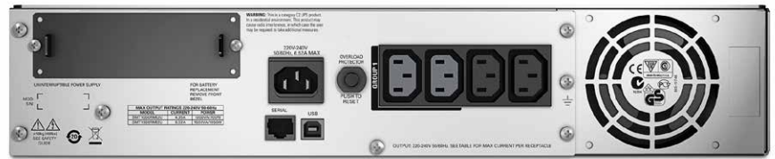
[ DLT1500RM12U ]