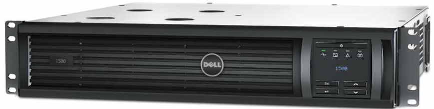
[ DLT1500RM12U ]