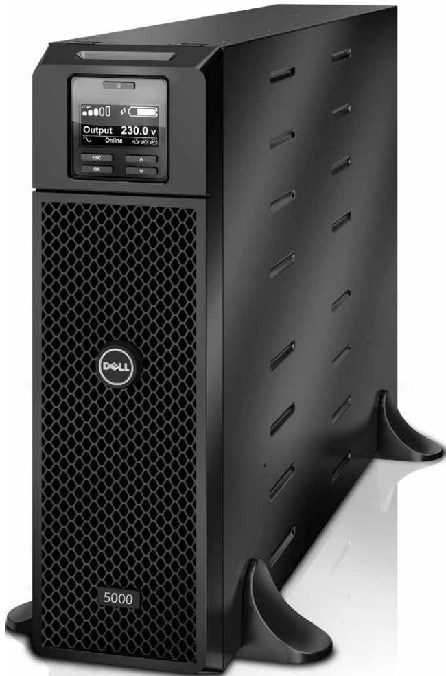
[ DLRT5KRMXLI shown ]